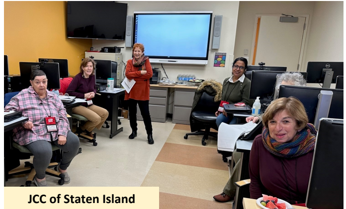
JCC of Staten Island

A warm welcome to our newest SMP volunteers from the JCC of Staten Island and Newtown Senior Center in Queens. They recently completed their Foundations Training and are ready to fight fraud in their community!