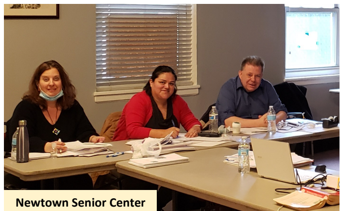
Newtown Senior Center